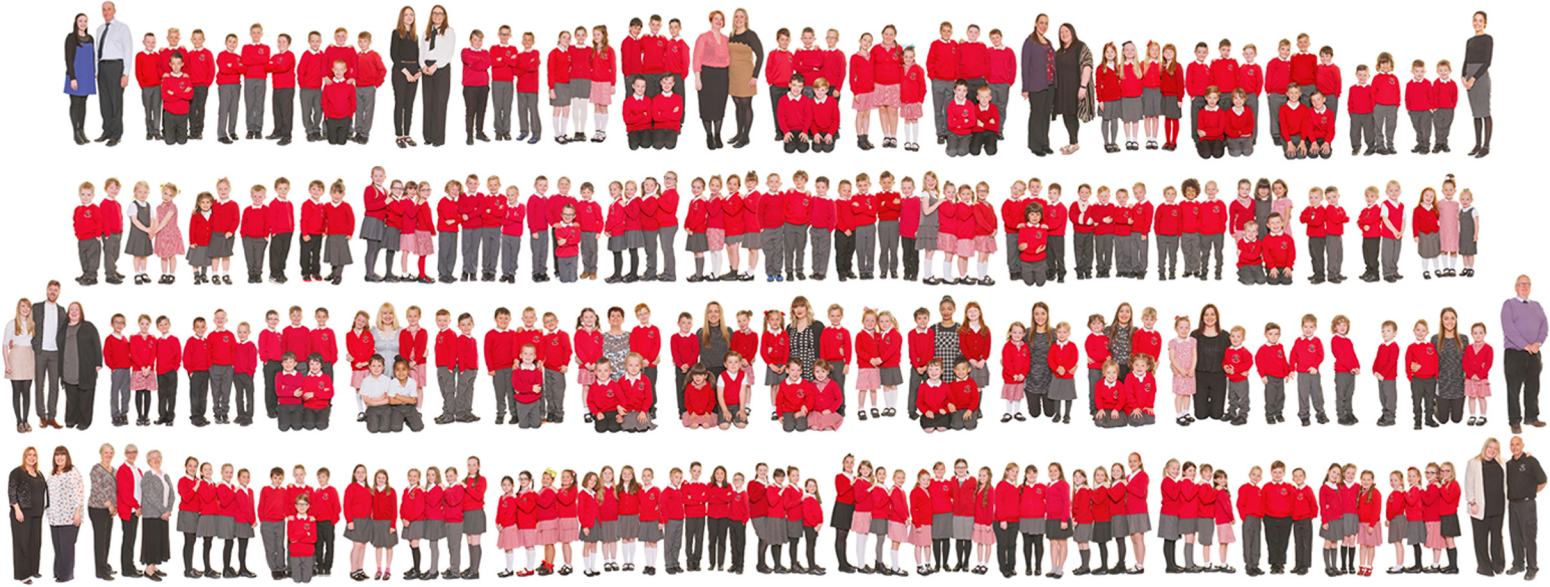
St Paul's C.E. Primary School

As an alternative to the staging option we can also provide a more modern take on Whole School Photography.